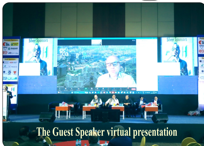
The Guest Speaker virtual presentation