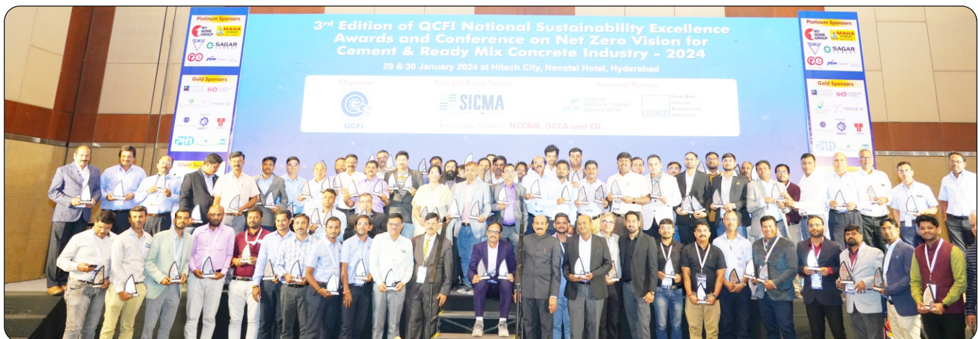
Award segment participants with their awards