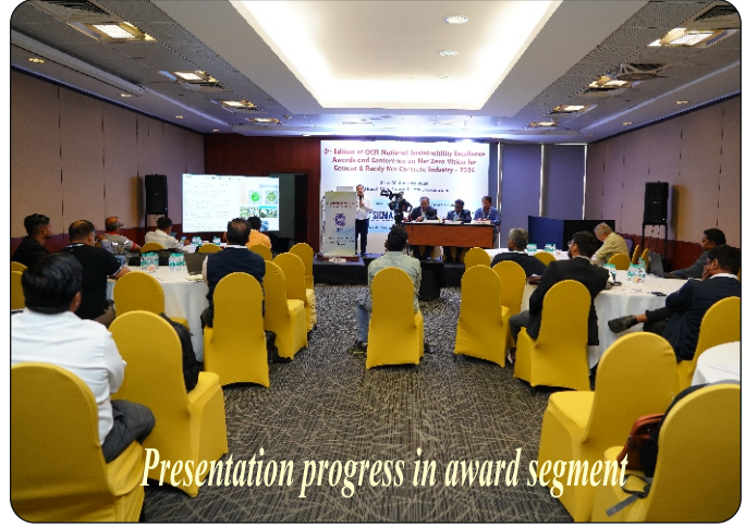
Presentation progress in award segment