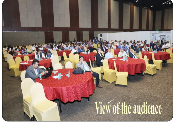
View of the audience