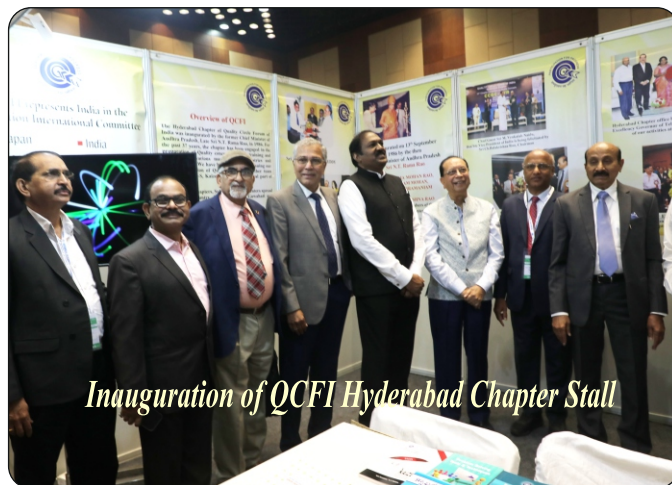
Inauguration of QCFI Hyderabad Chapter Stall