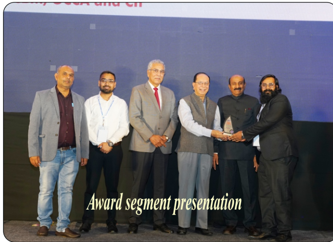
Award segment presentation