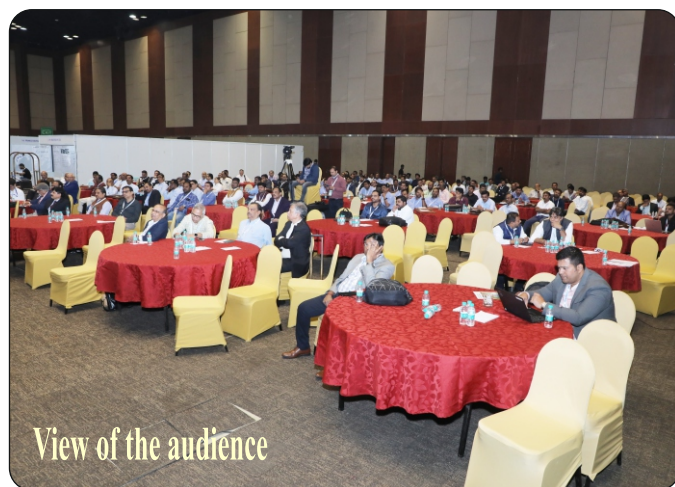
View of the audience